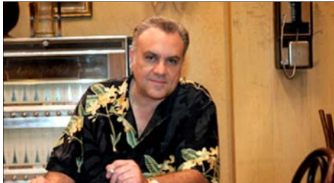
Vincent Curatola ("Johnny Sack" of the Sopranos) will be among the evening's models.

Wednesday, October 29, 2008 6:00 PM - 9:30 PM