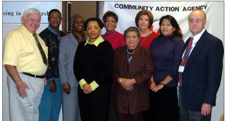
The Head Start PRISM Review Team prepares to conduct an impartial review of Bergen County Head Start.

During the week of November 14 th , a team of professionals from around the country conducted an intensive review of every aspect of Bergen County Head Start . Using a tool called PRISM (Program Review Instrument for Systems Monitoring), the team determined