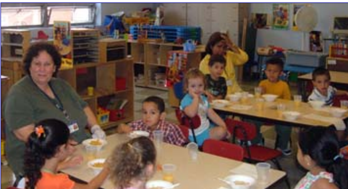
Children enjoy a nutritious breakfast to help them get a healthy head start on the day.

lots of learning and fun . A newly refinished gym allows children to fully participate in an age-appropriate physical education curriculum. A comprehensive library-media center houses bilingual reference materials for the children and families. Through a donation from United Way of Bergen County , the media center is stocked with computers to keep young minds engaged in the world of technology. Food service staff in the state-of-the-art kitchen are well equipped to serve up nutritionally-balanced breakfasts, lunches, and snacks.