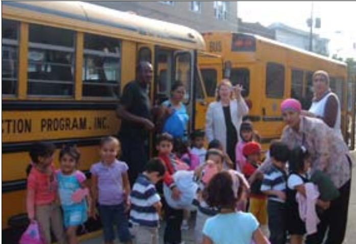
Teachers greet the children on the first day of classes at the new Fairview Head Start site.

The Fairview center provides a variety of important, enhanced services, including comfortable classroom space for