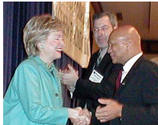
Senator Hillary Clinton at the National Community Action Foundation Conference in Washington, DC.