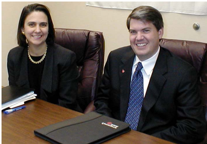
Commerce Bank Executives.