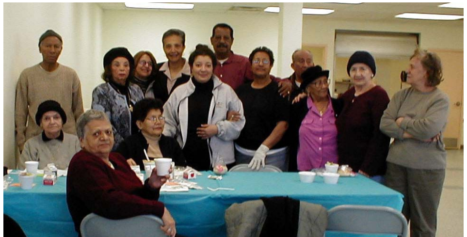
Hispanic Senior Citizen Center in Hackensack.