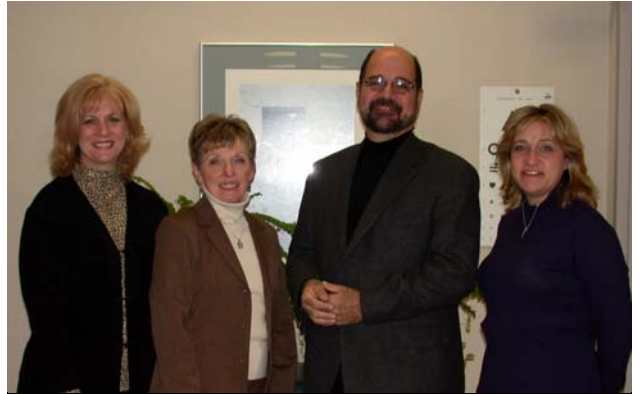
Federally Qualified Health Center comes to Garfield in partnership with North Hudson CAC.

BCCAP welcomes the opportunity to meet and work with new partners. Please contact BCCAP to offer your support.