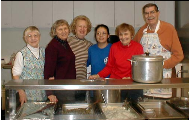
IRF volunteers from St. Matthew Lutheran Church (New Milford) preparing to serve dinner at BCCAP's Drop-In Center.

The evening meal at BCCAP's Hackensack Drop-In Center location is brought in and served by volunteers from the Interreligious Fellowship for the Homeless of Bergen County (IRF) . CAP's Homeless clients, and others needing a meal ("no questions asked") can eat at that location seven nights a week in a warm and comfortable environment.