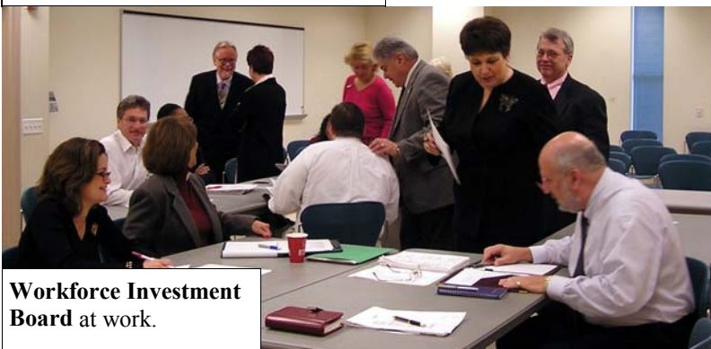
Workforce Investment Board at work.