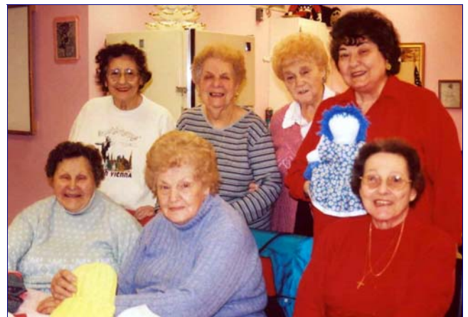
"Doll-makers" from the Garfield Senior Citizen Center preparing to stitch up some cuddly companions for the children.