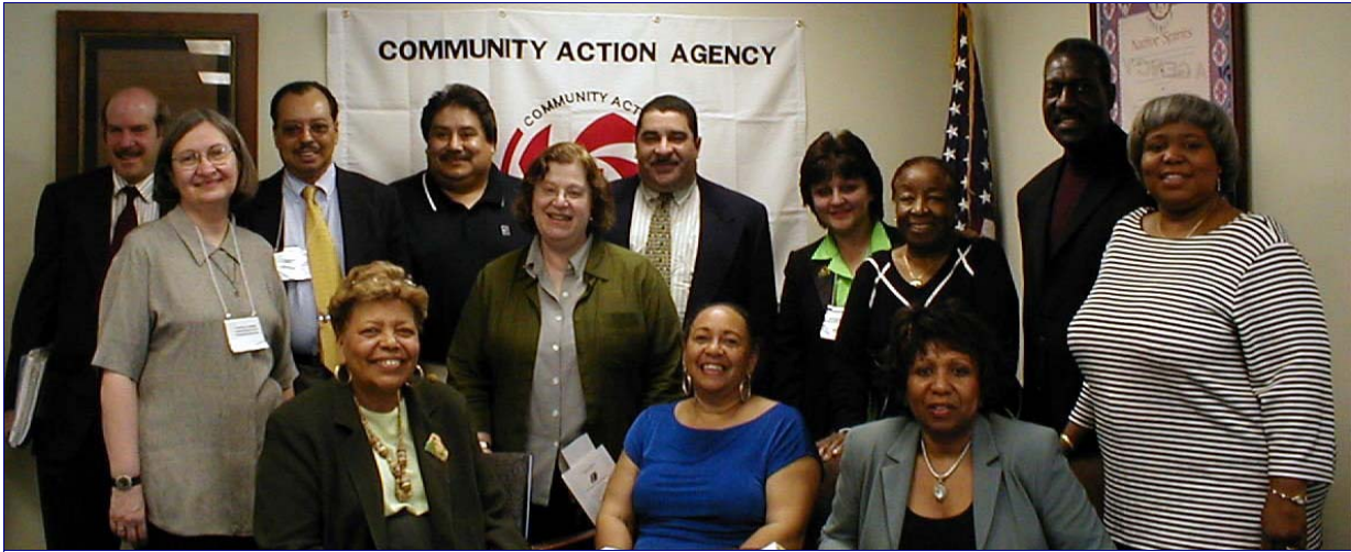
Head Start Federal PRISM Review Team.